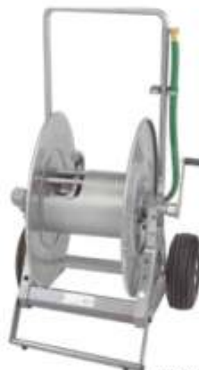
GHAT1200 configuration shown