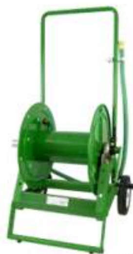
GH1100 configuration shown in optional green powder coat finish